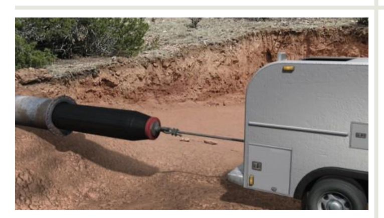
Fig. 3: Liner Under Tension The wireline unit keeps the liner under tension as it is pulled into the host pipe.